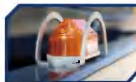
Acousto-optic Warning Lights