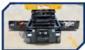
Design of Integrated Double Open Door