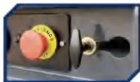
Emergency Descent Device