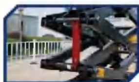
Safety Overhaul Bracket